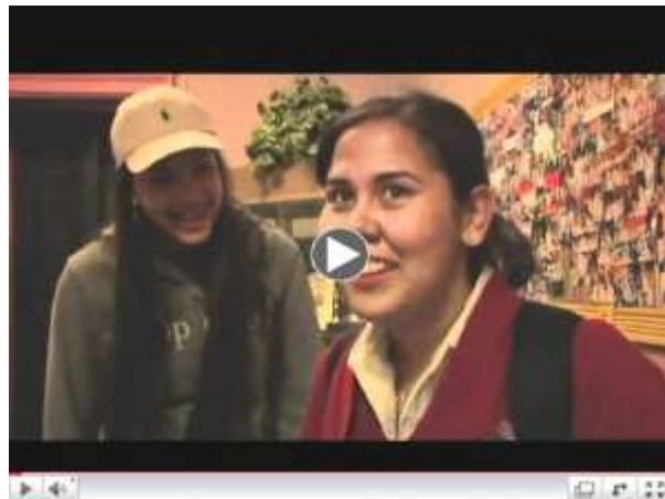
The St. Michael Academy 2010 Girl's High School Softball Team Film

(We ran this in the newsletter soon after the school closed. We thought it would be nice to run it again, for those of you who have joined our email list within the last year or two...)