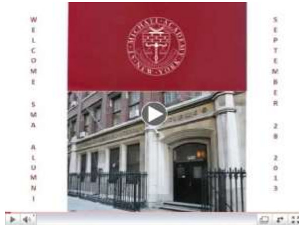
2013 SMAAA reunion 1963