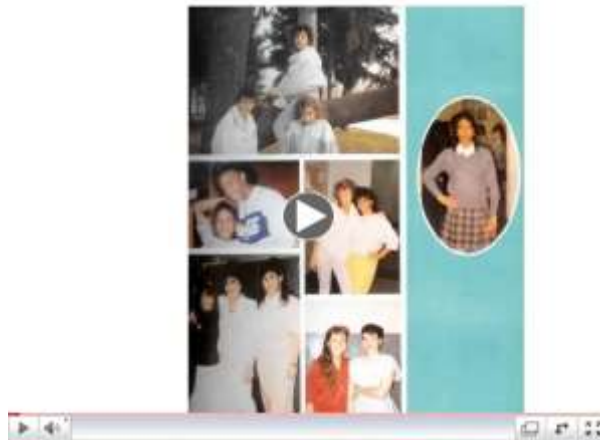
2013 SMAAA reunion 1988

If anyone wants to send an updated photo and/or message to their fellow classmates for this year's reunion please send it to smaaanyc@gmail.com . We will include it in this year's presentation. Please include your name and graduation year.