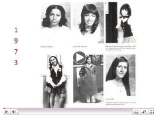
2013 SMAAA reunion 1973